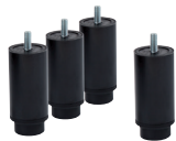
4 HEIGHT ADJUSTABLE LEG KIT