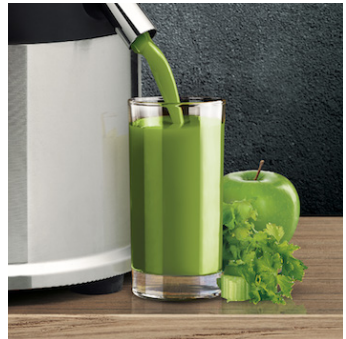
Smoothie direct to container