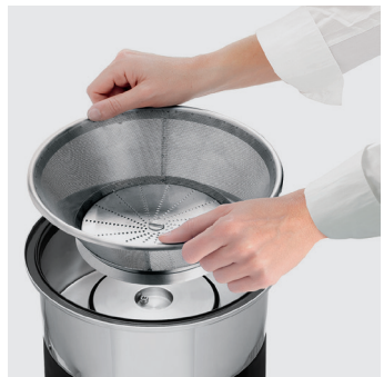
Easy to remove and clean