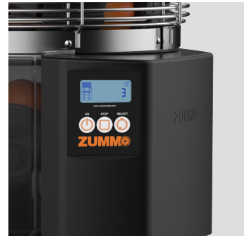
Higher juice extraction speed