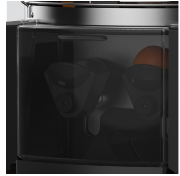
Smoky grey front cover