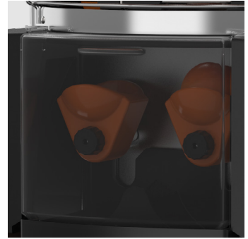
Smoky grey front cover