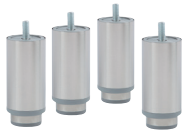
4 HEIGHT ADJUSTABLE LEG KIT